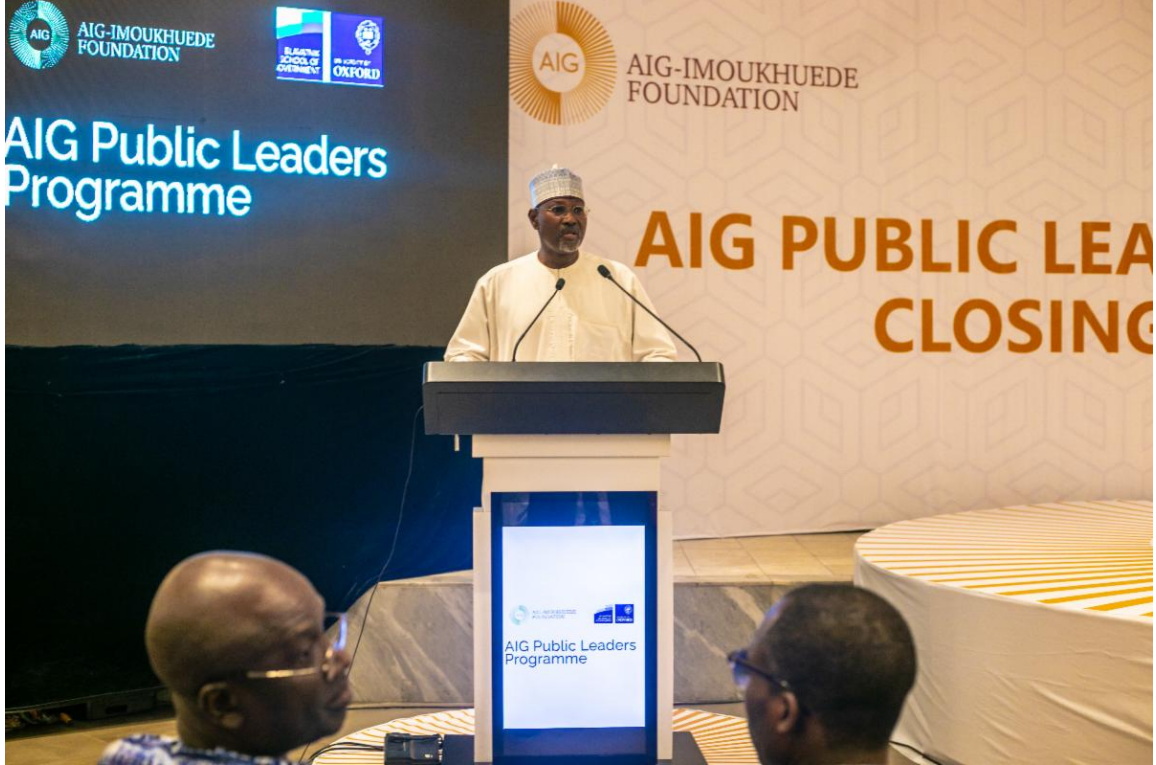
Professor Attahiru Jega, delivering his keynote address