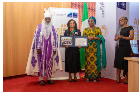
AIG Public Leaders Programme Graduation Ceremony

Our AIG Scholarship programme continues to grow, and in 2022 we sent our 28 th and 29 th scholars to the University of Oxford to undertake the one-year Master of Public Policy Programme.