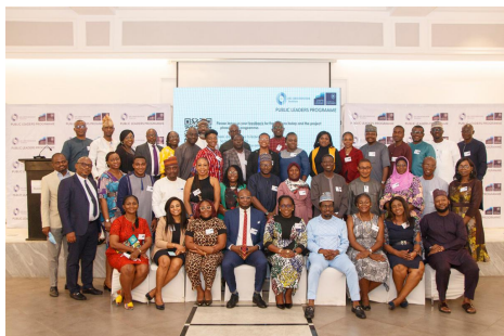
AIG Public Leaders Programme Class of 2021/2022

We have been thrilled by the impact PLP graduates are having, as they use the learnings they gained during the programme to shape positive change, with many of them receiving commendations and awards for the capstone projects they implemented in their organisations after the programme.