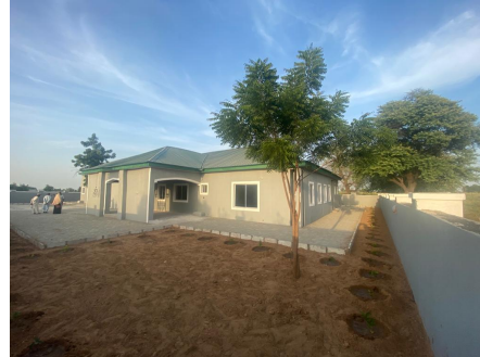
Completed Primary Healthcare Facility at Bauchi State.

We joined our partners GBCHealth to celebrate the launch of the Future United Initiative with the Future United Awards in New York. Future United is a new initiative by GBCHealth that draws together businesses, NGOs, governments, entrepreneurs and investors to work collaboratively to future-proof the world against global health challenges. In line with our vision of a better future for Africa, we sponsored the Futurist Award, which recognises innovative projects that will change the future of global health.