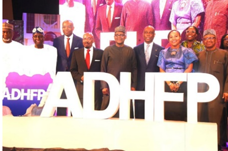
Formal Launch of the Adopt-a-Healthcare-Facility Programme