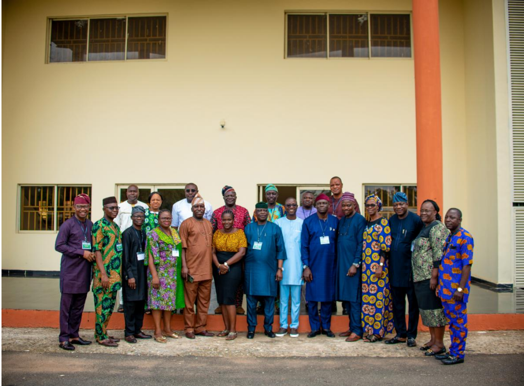
Cross section of Ondo State Permanent Secretaries

The quality of the public sector leadership is a key driver of public sector performance and so at the Foundation, we are committed to supporting the development of public servants. In May, we partnered with the Ondo State Department of Public Service Reform and Development to deliver a comprehensive Project Management and Process Improvement training programme to Permanent Secretaries. These Permanent Secretaries are now equipped with the skills they need, to drive reform initiatives across their Ministries.