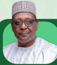
Dr. MUHAMMED Ali Pate. Incoming CEO of GAVI, The Vaccine Alliance.