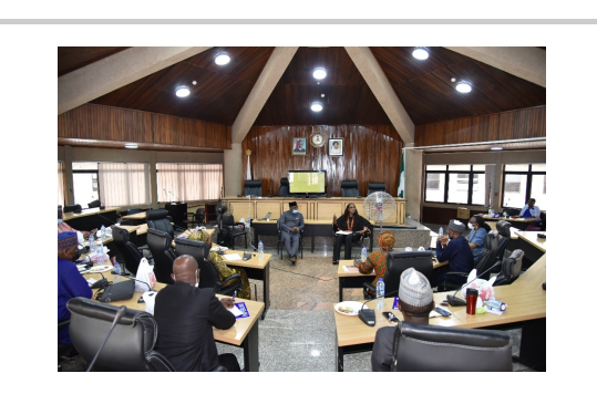
Cross-section of Federal Permanent secretaries

As part of our partnership with the Office of the Head of the Civil Service of the Federation (OHCSF), the Aig-Imoukhuede Foundation organised communication training sessions for Federal Permanent Secretaries. The training sessions were focused on helping participants develop and communicate key messaging for the work of their departments.